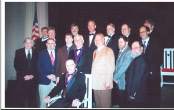
Pictured above are Lewis & Clark Officers and candidates of the Day.